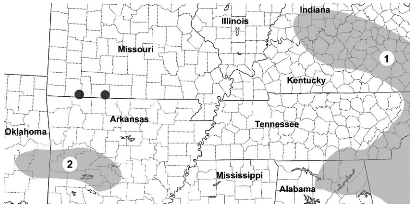
Fig. 7. Schematic distribution of the Anillinus species. 1—range of eastern species; 2—range of western species; solid circles—sampling sites of A. aleyae , new species. From Sokolov et al. (2004) and original data.

will need to propose the presence in the past of a trans-Arkansas River track to accommodate an Ozark-Ouachita lineage.