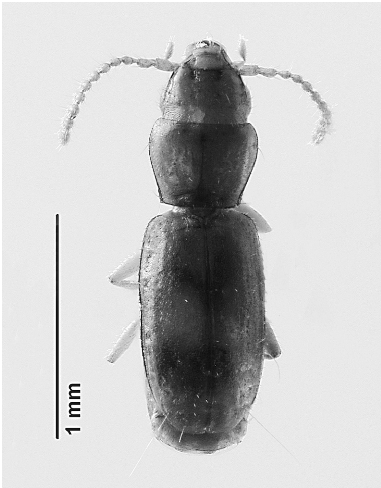
Fig. 1. Habitus of Anillinus aleyae , new species, dorsal aspect, female.

slightly enlarged, paramere apex with poriferous canals, but without visible setae (at \times 400 ). Right paramere (Fig. 4) elongated, sharply curved near the middle, with subparallel apical half, bearing five long setae, nearly equal in length to the apical half; setae occupy entire apex of paramere. Spermatheca (Fig. 5) moderately sclerotized, with three well-developed parts. Distal part, the cornu, is sclerotized and bean-like in form, more than two times longer than its width. Proximal part of cornu unsclerotized and straight, without traces of coils. Nodulus and ramus well-developed, sclerotized; nodulus elongated, ramus rounded. Spermathecal duct comparatively long, with defined wide coils. Stylomers and ventrite IX as in Fig.6. Stylomer of approximately equal width and length, with thick ensiferous seta. Ventrite bearing 14–17 setae.